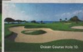
Ocean Course Hole 10.