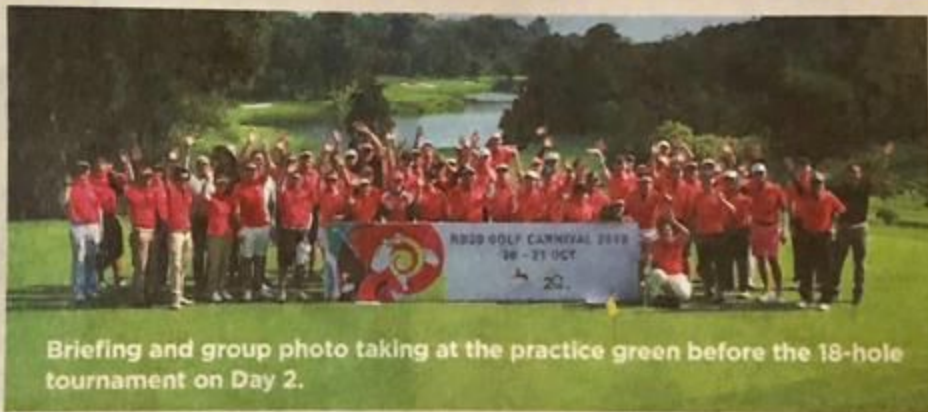
Briefing and group photo taking at the practice green before the 18-hole tournament on Day 2.

On the day of arrival, golfers kicked off