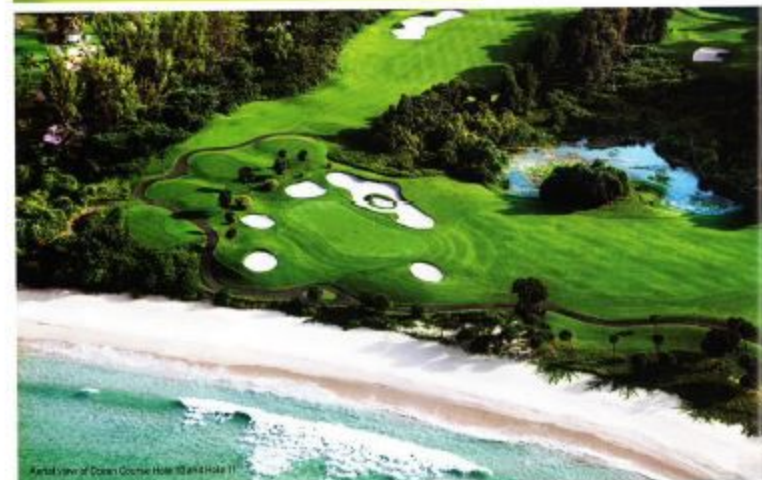
Aerial View of Ocean Course Hole (20th Hole)

The chorus of natural sounds emanating from the wild fauna together with the sounds of the ocean, transport